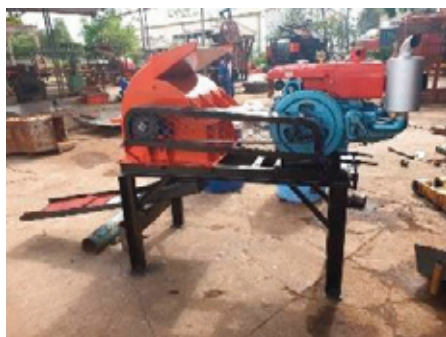
32 Beater Hammer Mill