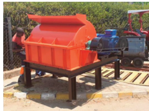
Hammer Mills 80 Hammers 4t to 6t per hour