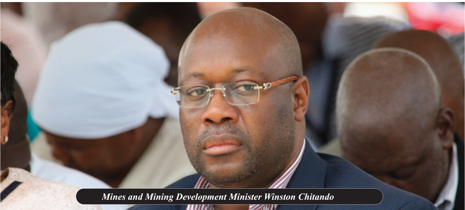
Mines and Mining Development Minister Winston Chitando

Mines and Mining Development Minister Winston Chitando says an investor who has shown interest to establish a gold mine in Ngundu, Masvingo province is expected to move on-site by September. Recently, the government announced that it was in talks with an unnamed investor to establish a gold mine in Ngundu.