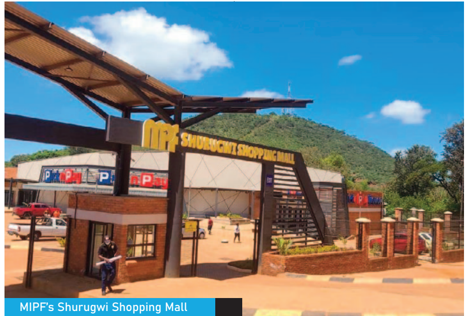
MIPF's Shurugwi Shopping Mall

While working at ZIMASCO, I observed inefficiencies in bulk mineral transportation, including delays, limited multi-modal options, and high logistics costs due to over-reliance on road transportation. Silvergill was created to address these gaps, offering integrated, end-to-end logistics solutions, particularly