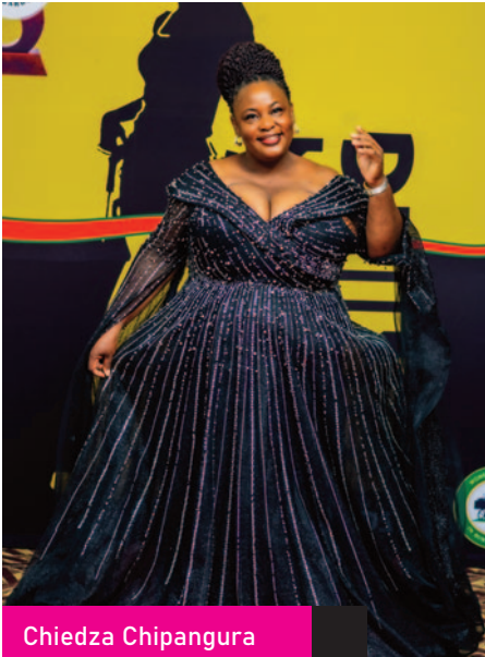
By Rudairo Mapuranga

It was not merely a dinner, it was a homecoming. The Monomotapa Hotel shimmered on Friday, 6 March 2026, not just with elegance, but with the collective power of over 100 women and industry leaders gathered for the Women in Mining Service Excellence Awards, Mining Zimbabwe can report.