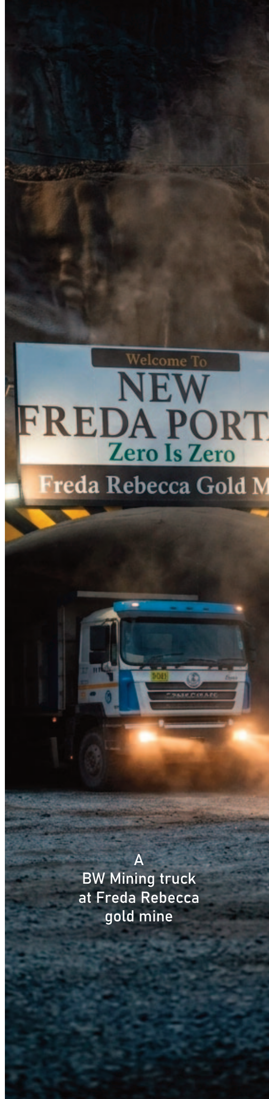
A BW Mining truck at Freda Rebecca gold mine