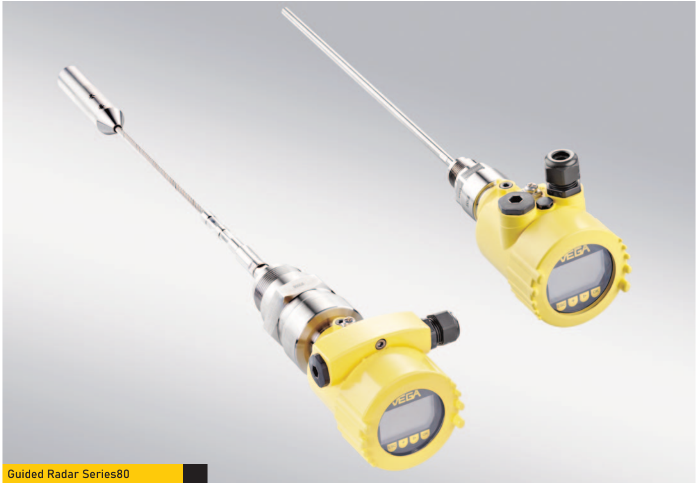
Guided Radar Series80

Flotation cells are the heartbeat of mineral processing plants across sub-Saharan Africa. Whether it's copper, platinum group metals, gold or phosphates, the efficiency of the flotation stage determines how much valuable material actually makes it out of the slurry and into the plant's revenue stream. And as every plant manager knows, flotation is a fragile balance. Slight shifts in density, level or foam stability can send efficiency plummeting.