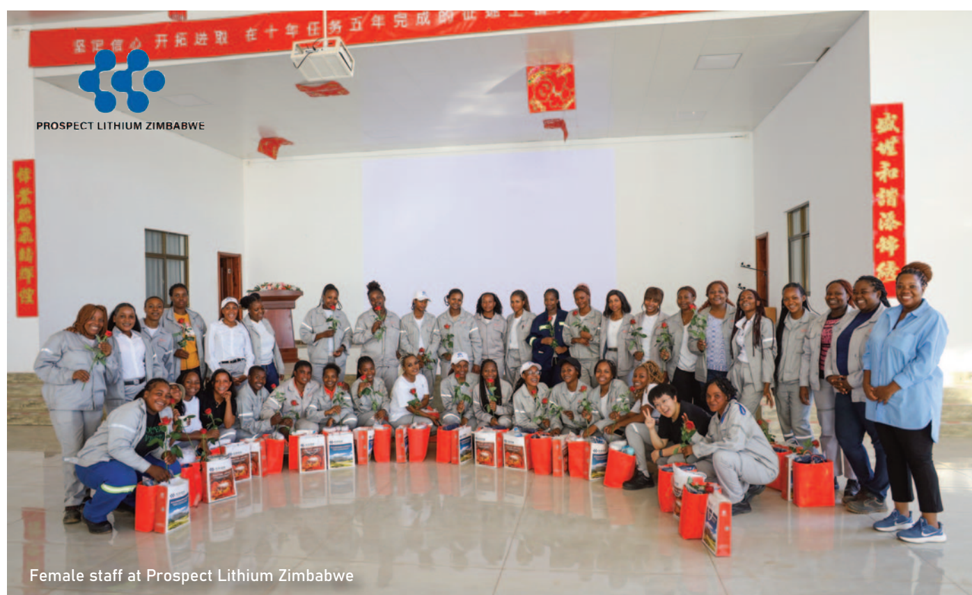
Female staff at Prospect Lithium Zimbabwe

And in Goromonzi, many of those futures are being powered by women!!