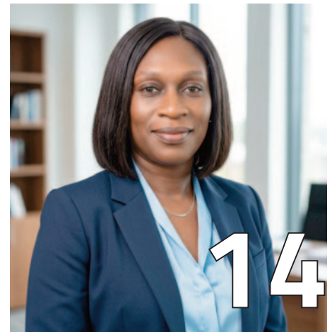
Chemist to Lab Leader

32 Beyond the Lithium: How Prospect Lithium Zimbabwe is Powering the Future Through its Women